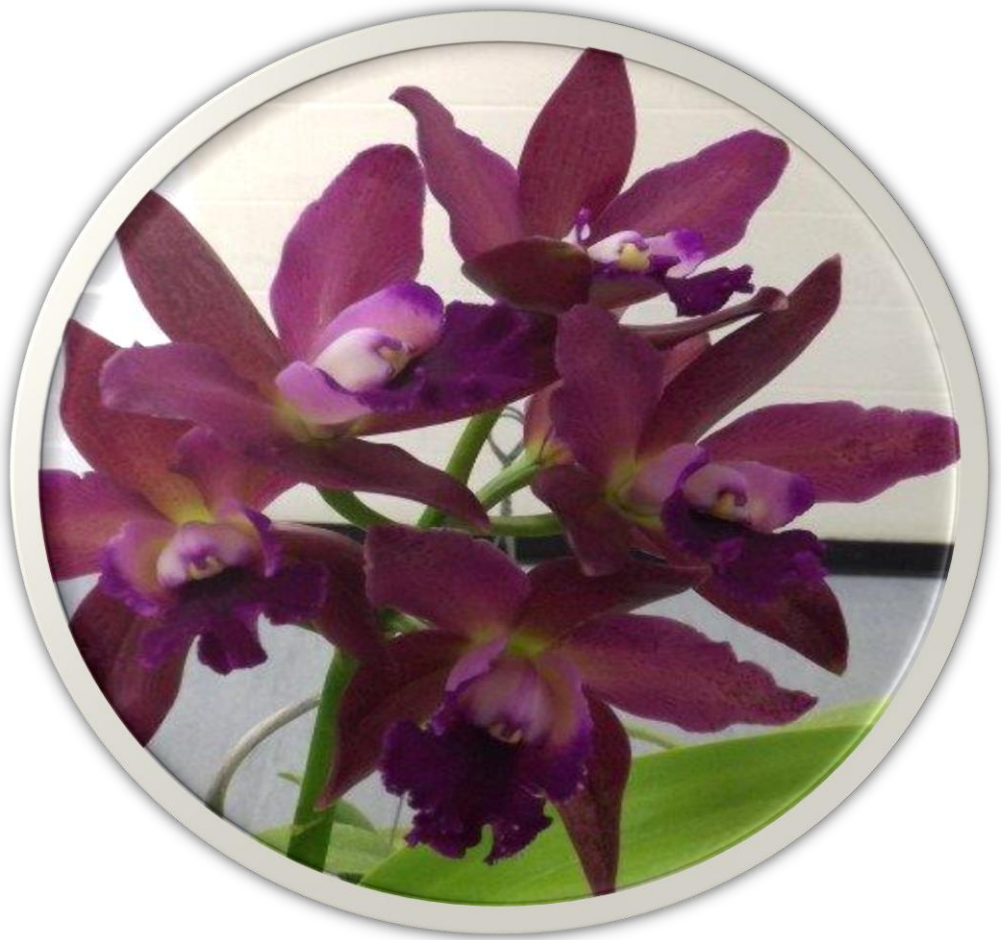
C Deception Spots x C Netrasiri Waxy 2nd Popular vote open & 1st judged cluster Open Cattleya